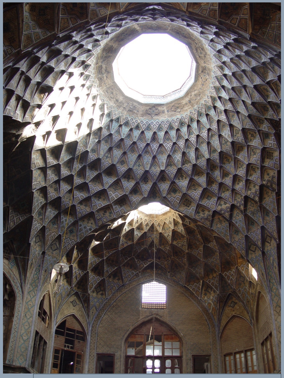
Bazaar of Kashan, Iran, Amin al-Dowleh Complex, 19th century